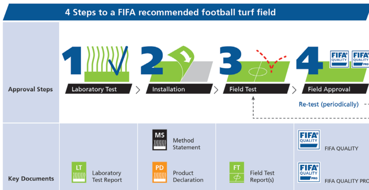
Fig. 1.2 Approval process steps and the related documents / parties

The FIFA Quality Programme is the certification of a particular field that has been found to fully meet the requirements of the Quality Programme. It is not the approval of products. In order to be certified, football turf fields must reach the performance and quality criteria established to provide the best possible playing conditions. To this end, each field must undergo four steps as outlined below: